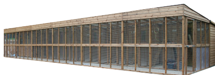
Licensed Boarding Cattery (10no Pens)